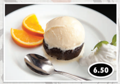
Melted Chocolate Cake w/Vanilla Ice Cream