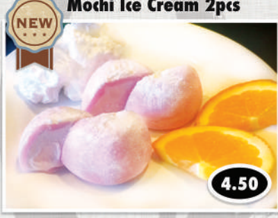
Strawberry / Coffee / Mango / Chocolate